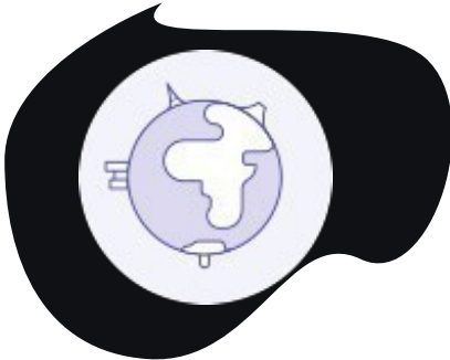
174+ Countries Supported