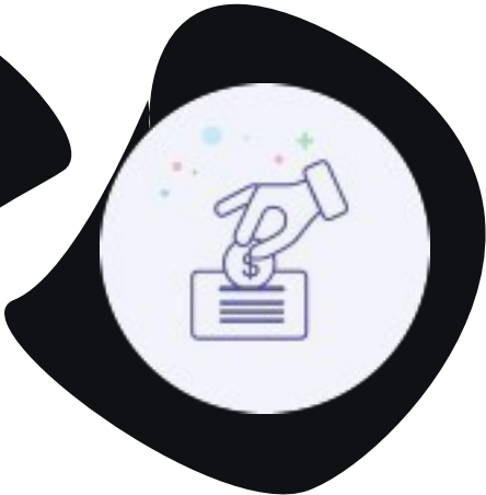
HIGHLY Secured Investments