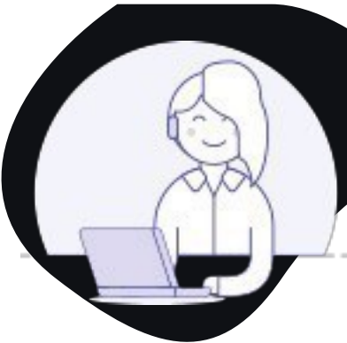
24/7 Live Support

Global institutions, leading hedge funds and industry innovators turn to